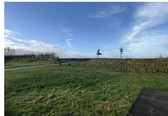
Council Tax Band - D