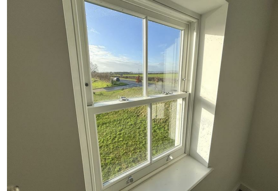
Living Room/Dining Room 27'6 x 9'10 (8.38m x 3.00m)